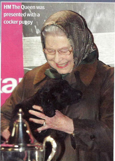
HM The Queen was presented with a cocker puppy

was tried for behind the line — again, this was found by the judges off the ground in a thorn bush. A good flush finished an eventful run.