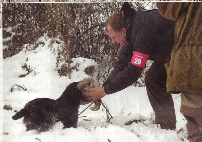
▶ Icy cold conditions and temperatures of -11°C persisted on both mornings of the competition

job of collecting a woodcock shot well out on the snow — FTCh Maesydderwen Snoopy's first flush resulted in the bird being hung up in a thorn bush, but a second flush gave them a cock to retrieve and, after flushing a hare, a live pigeon shot out in the field was soon in the bag. FTCh Mallowdale Midge showed exceptional hunting ability, ▶