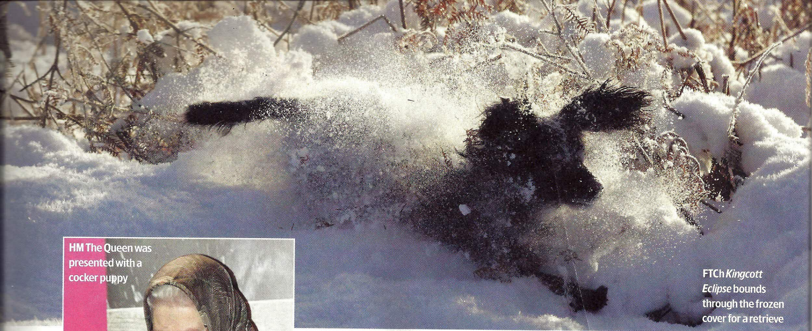
FTCh Kingcott Eclipse bounds through the frozen cover for a retrieve